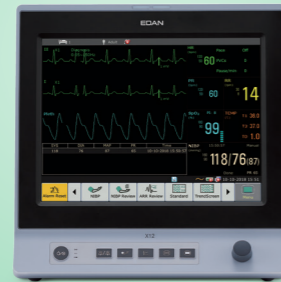
X series Patient Monitor